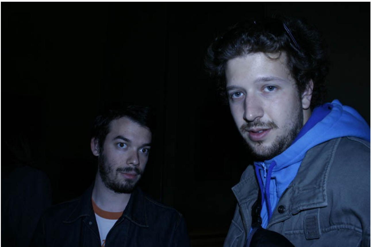
Me on the left, Mona Lisa in the middle and my friend on the right and our friend behind the camera invisible, subtracted from the photo.

I have came up with the idea to adjust the flash into extreme and fading the painting in the background between us into black. Following this One Night in Paris was born.